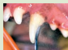
Scale and Polish: Removing the calculus using an ultrasonic scaler, followed by polishing, is a very effective form of treatment