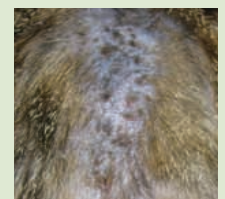
Flea infestations in cats often lead to over grooming and bald patches, commonly with crusting