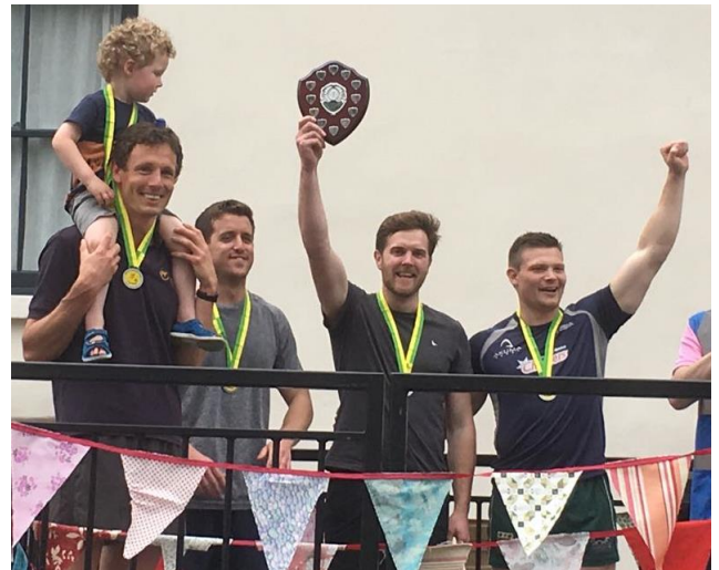
(2018 Tetbury Woolsack Men's Team Champions)